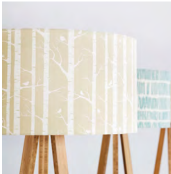
PATTERN. BIRCH FOREST COLOUR. ALMOND