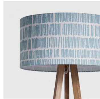
PATTERN. CRAYON COLOUR. STREAM

Special order lamp shades available on request.