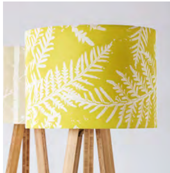
PATTERN. BRACKEN COLOUR. COCKATOO