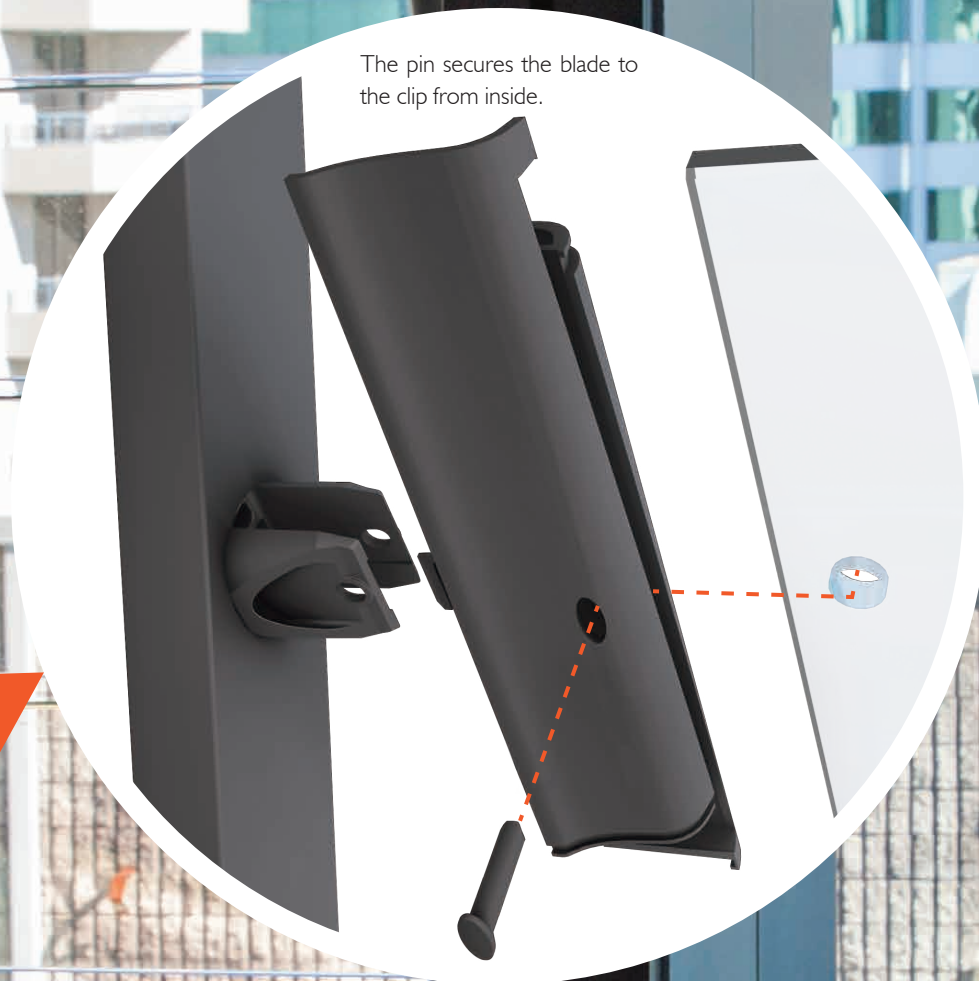
Iglu Student Accommodation, Chatswood, NSW

The pin secures the blade to the clip from inside.