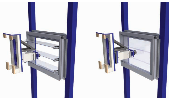
Load test in opened position

In the closed position, the face of a toughened Stronghold glass blade can sustain loads of up to 75kgs without breakage.