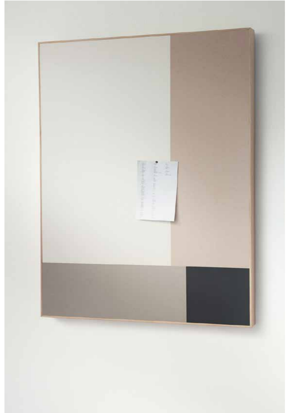
2182 | potato skin 2187 | brown rice 2206 | oyster shell 2209 | black olive

Framed or mounted bulletin board can be made in single colours that fit your needs or in decorative combinations that enhance your environment. Possibilities across different sizes are ideal to hold your thoughts or expose your creativity.