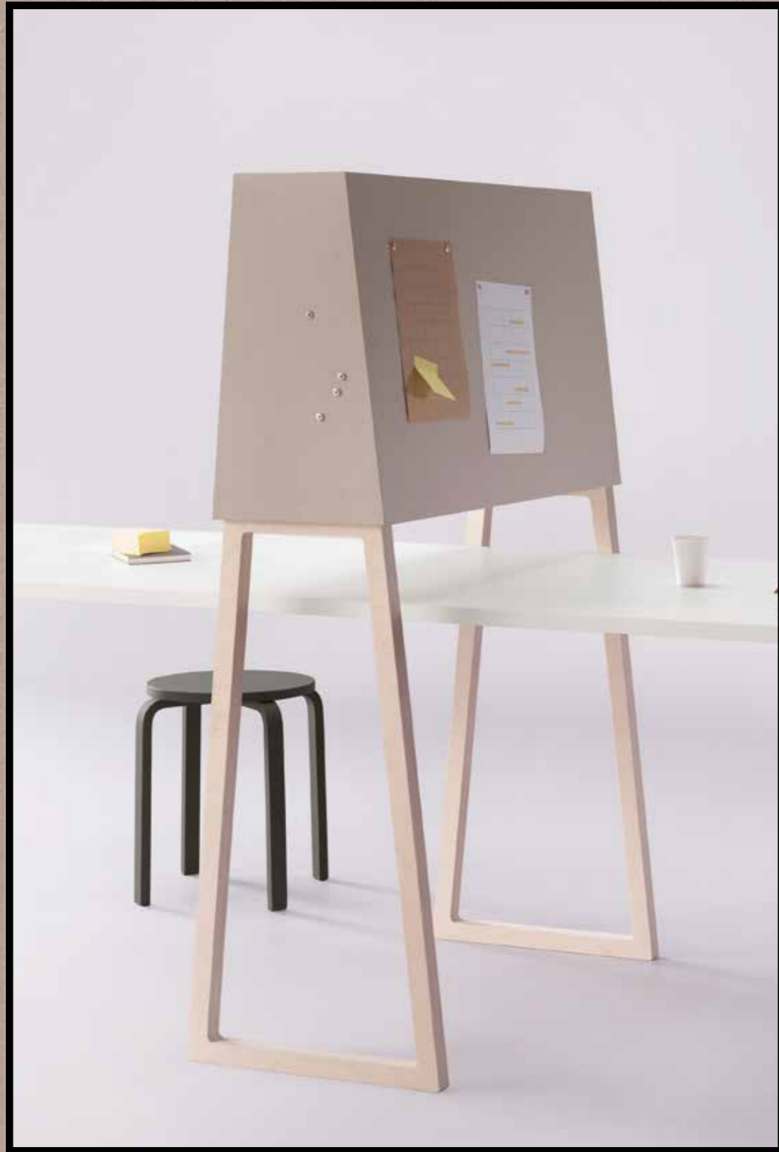
2187 | brown rice