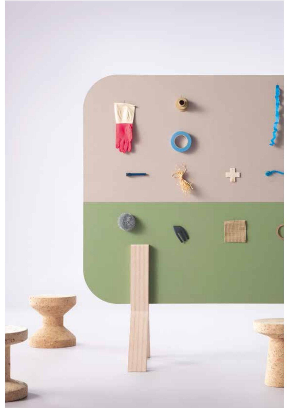
2187 | brown rice 2213 | baby lettuce

BULLETIN BOARD provides ideal solutions for the modern sustainable office environment where partition walls or furniture elements can double as functional information carriers.