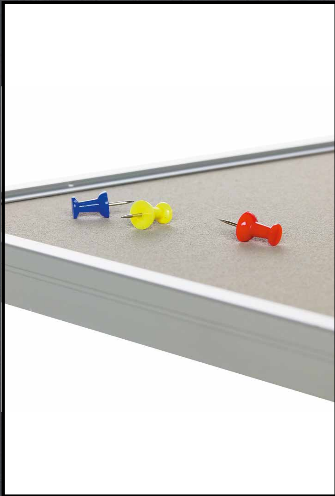
2187 | brown rice