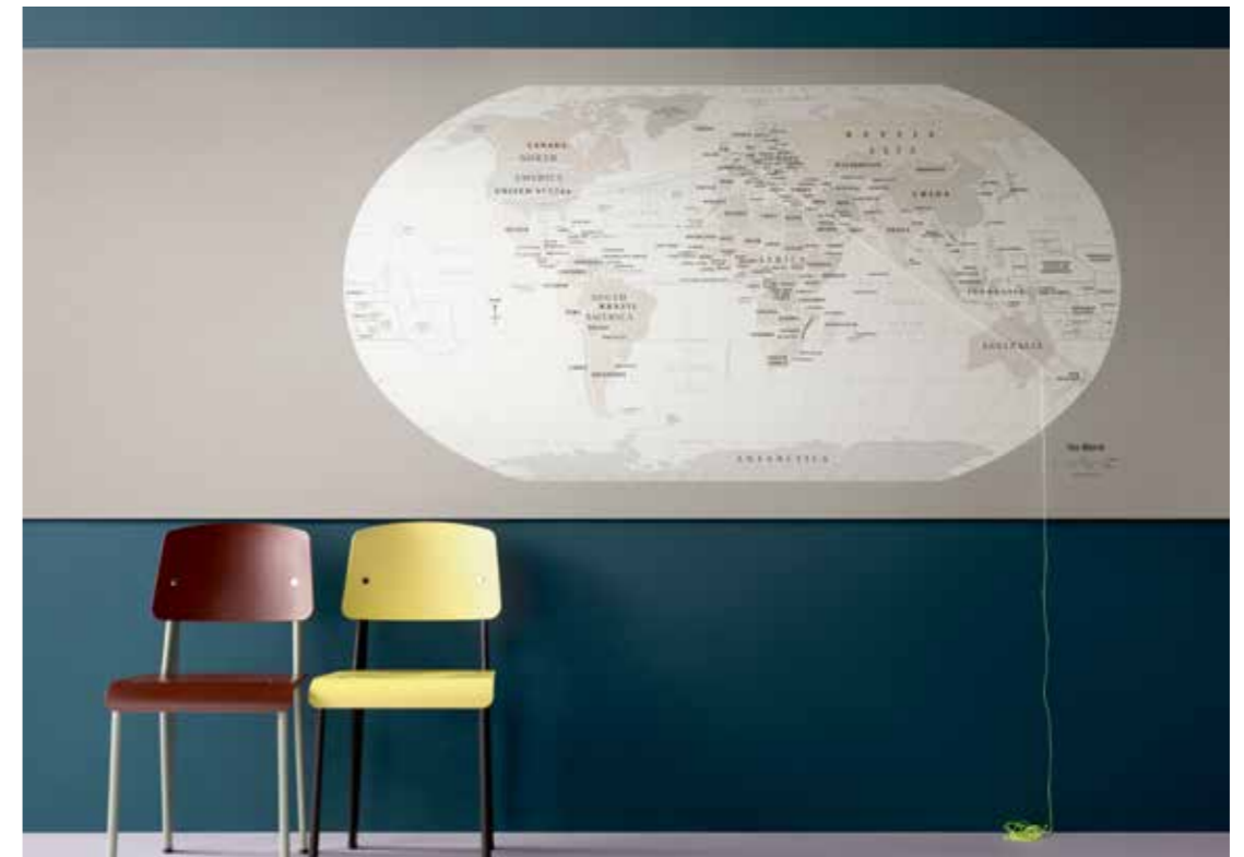
2182 | potato skin

BULLETIN BOARD is supplied in rolls up to 28 metres long and 1.22 metres wide, making it suitable for large installations, for example in conference rooms or alongside corridors.