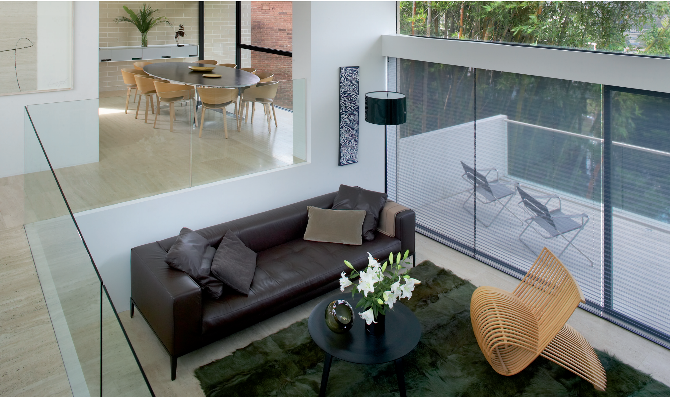
Verosol Pleated Blind - fabric: 816 Originals Transparent, Onyx