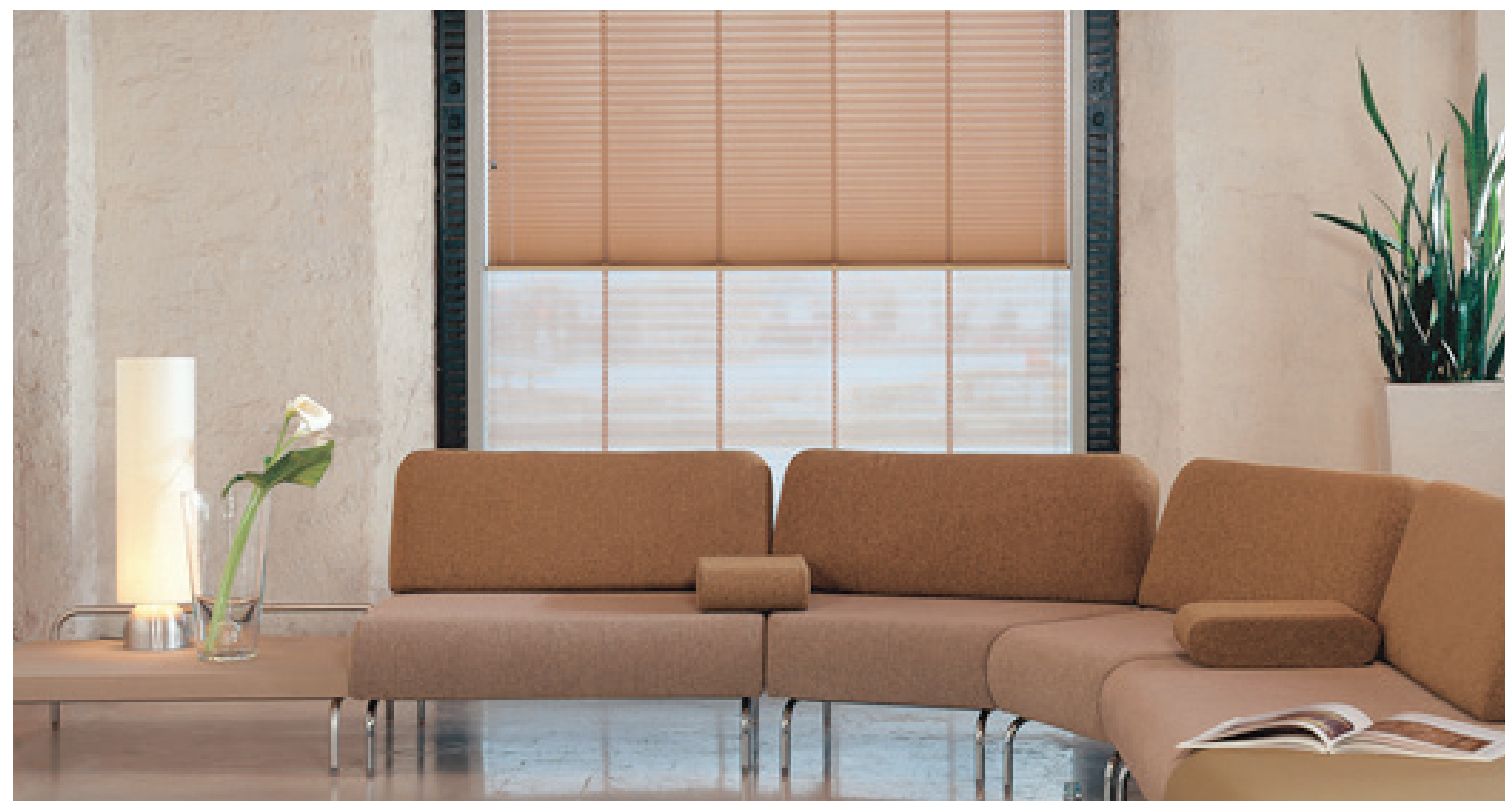
Verosol Twin Pleated Blind - fabric top: 878 Originals Non Transparent / fabric bottom: 816 Originals Transparent

With Verosol's Twin Pleat - you can adjust the blind so that either fabric covers as much of your window as you choose. By day, you can optimise your view - at night, you can lower the opaque section to block the view into your home.