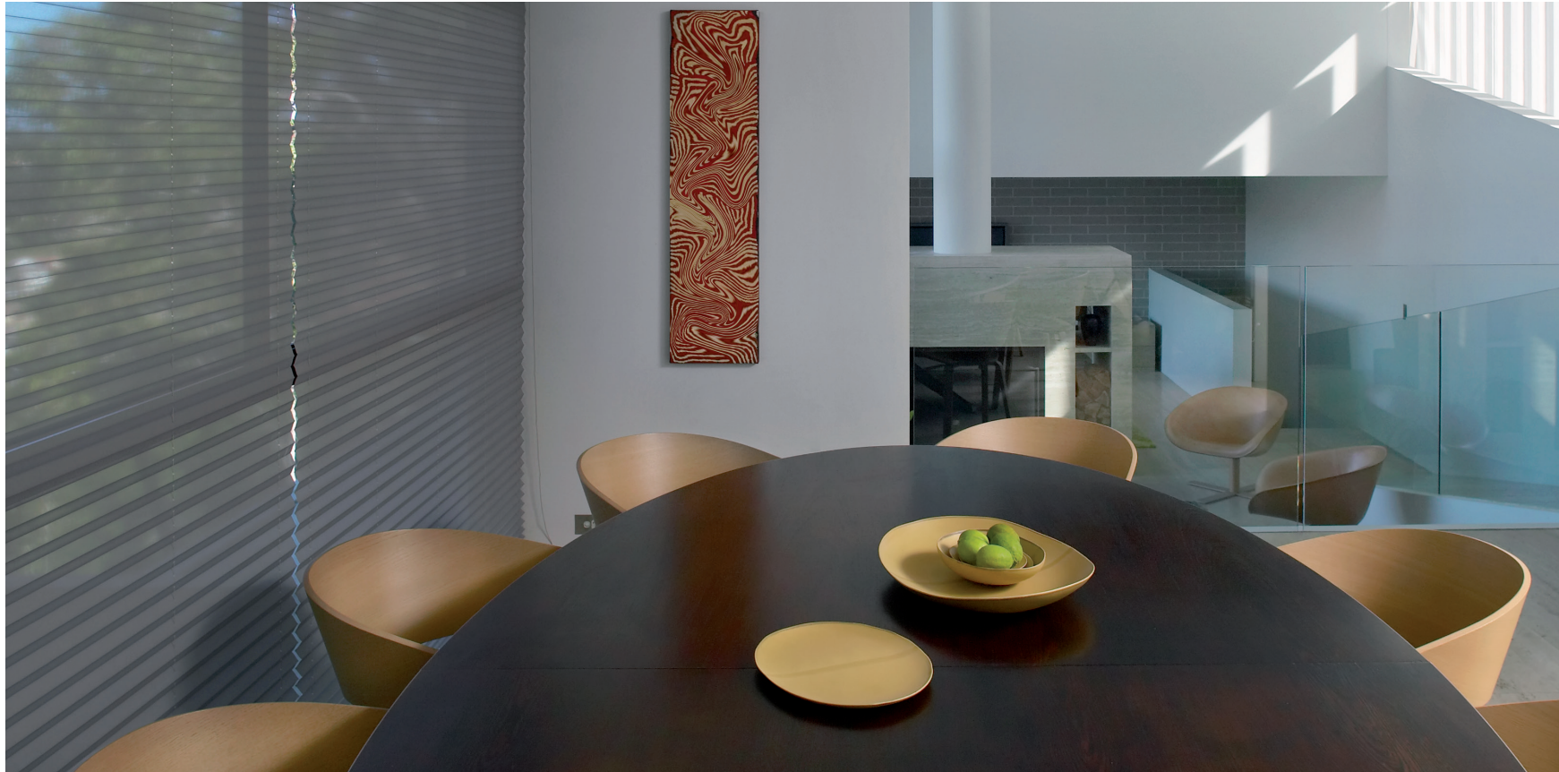
Verosol Pleated Blind - fabric: 812 Originals Semi Transparent, Gravel

As bold or discreet as you choose, Verosol pleated blinds offer total design freedom. Draw on a stunning range of colours, fabrics and transparencies to create the perfect look for any window, then finish with a coordinating or contrasting colour for the rails.