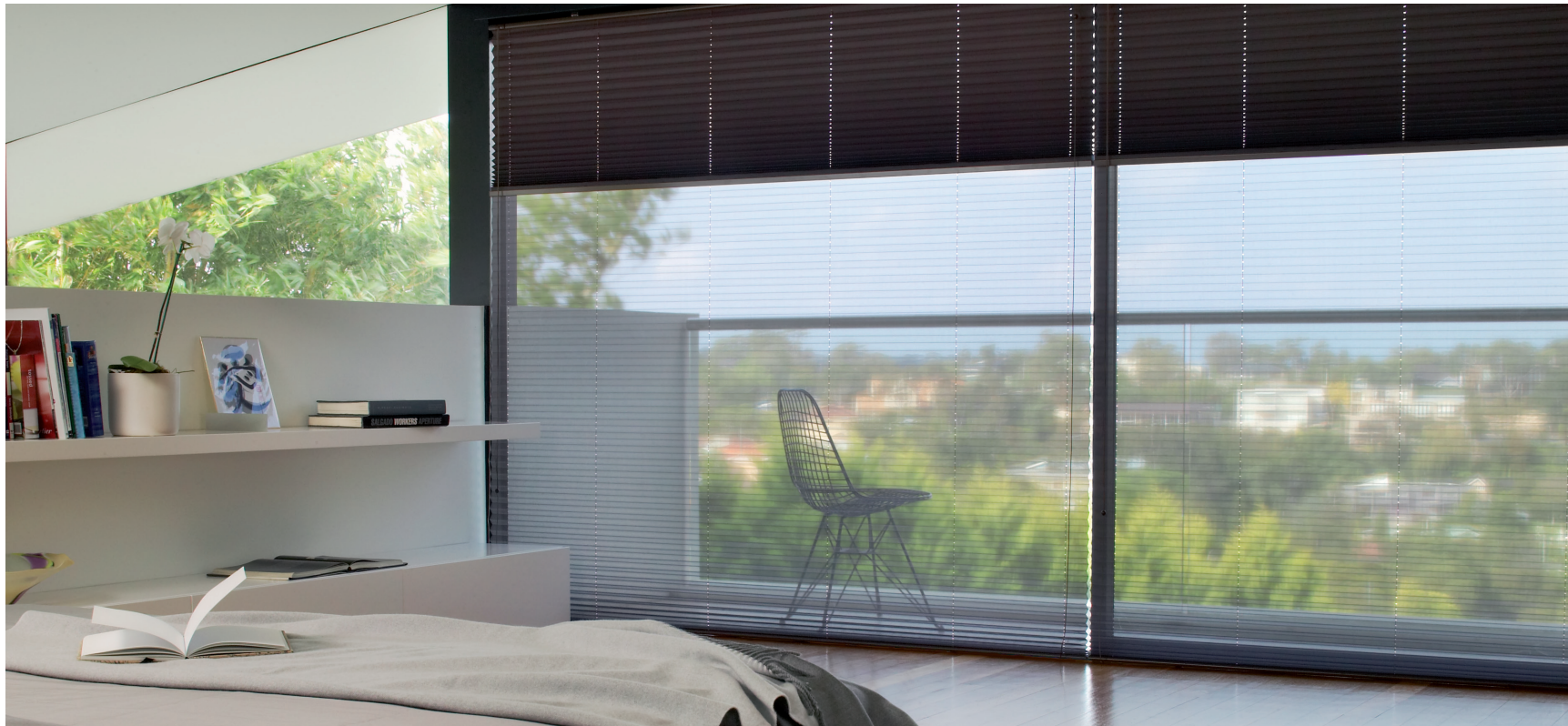
Verosol Twin Pleated Blind - fabric top: 878 Originals Non transparent / fabric bottom: 816 Originals Transparent

Two blinds in one, the Verosol Twin offers complete flexibility and function. By combining two fabrics with different densities and transparencies into one blind, the Twin provides privacy, heat and glare protection without obscuring your view.